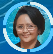
H.E. Ms. Lalatiana Accouche High Commissioner High Commission of the Republic of Seychelles, India