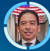
H.E. Dato' Muzafar Shah Mustafa High Commissioner High Commission of Malaysia, India